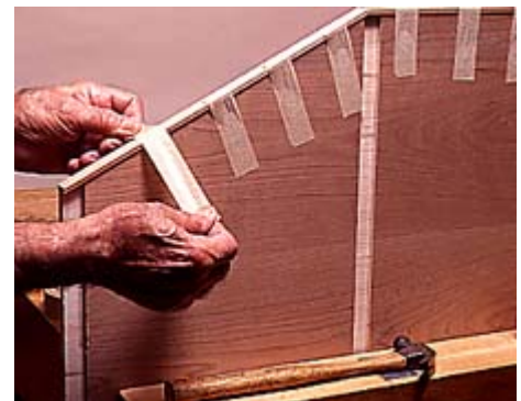
4--The edge banding is glued, and held in place using masking tape. A pair of brads in each band keeps it from slipping.

Next, use a smooth-cutting blade to rip the edge strips. Cut them to finished length, apply glue to them and the panel edges, and then hold them in place with masking tape (Photo 4). Drive a tiny 1/2-in. 20-ga. brad near the end of each strip to help hold it in place. When the glue has dried, carefully plane the strips flush to the panel's surface, and use a chisel to cut the strip away at the top corner of the lower case (Photo 5).