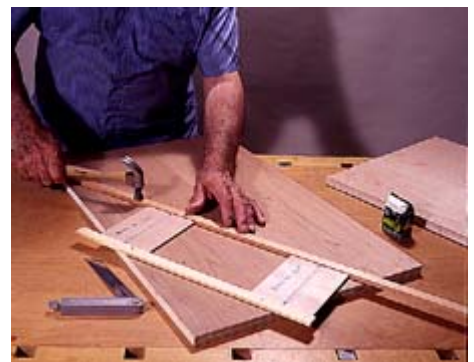
1--Use a strip of wood and a pair of blocks to position the guide strip on the case side. Nail the strip to the panel.

The finished cuts are made on the table saw . To