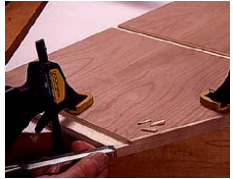
5--The edge banding blocks the rabbet at the top of the lower case. Use a chisel to pare away the edge band at this point.

The cabinet's dentil molding is made with a router and a 1/2-in.-dia. straight bit. Bolt a fence to the router's base 53/64 in. from the bit. Rip the molding stock and joint its edges so they are parallel and the ends square. Make the first dado cut, move the fence into the groove, make the second cut and continue on in this fashion until the molding is complete (Photo 7). Make several passes on the router table to cut the thumbnail molding on the dentil's lower edge (Photo 8).