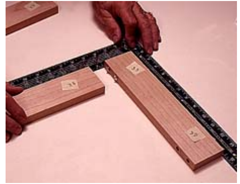
12--With dowel centers inserted, press the door parts together while aligning them with a framing square.

The final touch is to install two 3-light, 20-watt halogen Combilight kits. The product is sold at home centers and lighting showrooms. To locate a distributor, contact Lusa Lighting, 26235