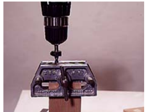
13--Use the marks created by the dowel centers to position the dowel jig. Bore the remaining dowel holes.