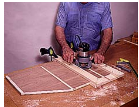
3--Use a router with a straight bit and a parallel fence jig to cut the rabbets and dados in the case sides.

The next step is to cut the dados and rabbets in the case panels with a router and straight bit. When cutting the dados for the horizontal panels, be sure to use a 23/32-in. straight bit because this is the actual thickness of 3/4-in. plywood.