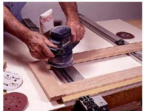
14--Sanding door rails and stiles can be tricky. Use a random-orbit oscillating sander to avoid crossgrain sanding.