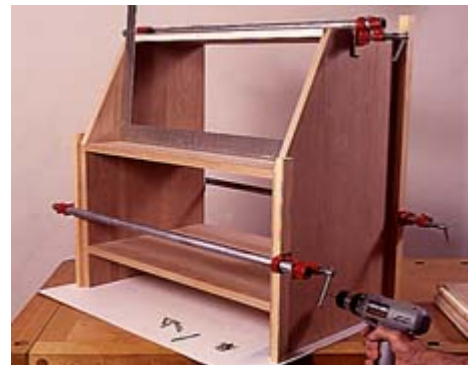
6--Glue and clamp the case sides to the horizontal panels and drive screws into the upper and lower panels.