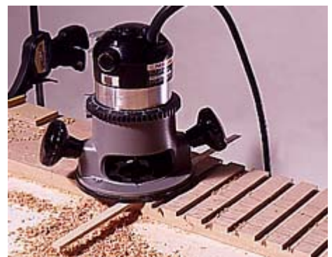
7--The dentil molding is cut using a router with a guide strip screwed to its base. The strip rides in the previously cut dado.