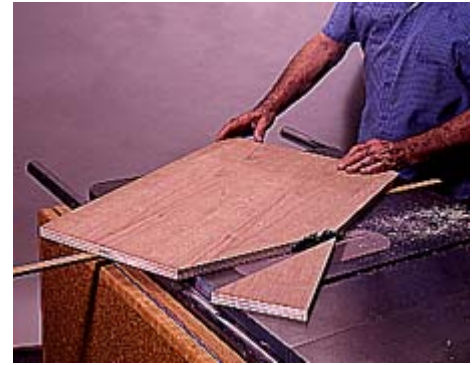
2--To cut the angle on each side panel, slide the guide strip in the miter gauge groove and push the panel through the blade.

make the angled cuts on the lower case pieces, take each rough-cut panel and nail a 3/8 x 3/4 x 24-in.-long tack strip to it as a guide. The tack strip rides in the saw's miter gauge slot. To position the tack strip accurately, first nail a positioning strip to the panel and then butt spacer blocks to it. Butt the tack strip to the blocks, and nail it in place (Photo 1). Slide the tack strip into the miter gauge slot, and feed the panel through the blade (Photo 2).